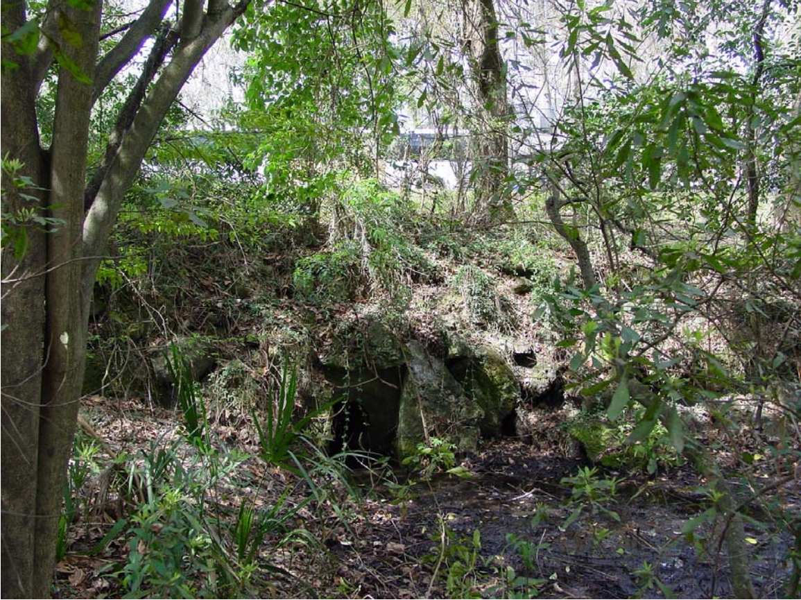
University of Florida Conservation Area Land Management Plan Green Pond and Newins-Ziegler Sink