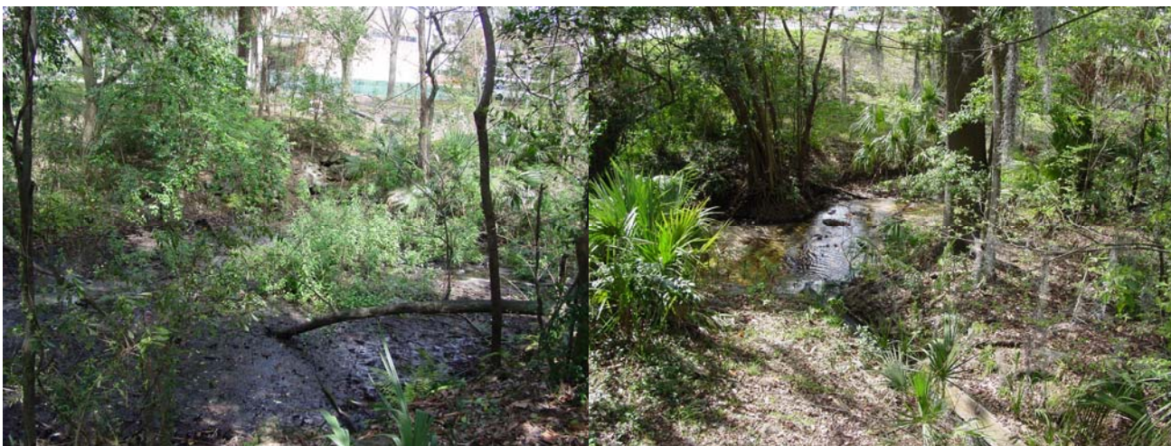
Green Pond Creek

These conservation areas are in the Lake Alice watershed, where stormwater is an issue of concern. Since these conservation areas are upstream of Lake Alice, there may be some merit in considering future modifications to enhance storage capabilities in all three sink areas (the third being the depression in the wooded area just south of Green Pond).